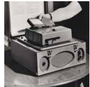
1960's Cassette player © RNIB Heritage Services.

In the 1960s-70s cassette players started to be used.