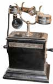
1920's phone © Canva.

1920's phones had little accessibility for people with sensory loss.