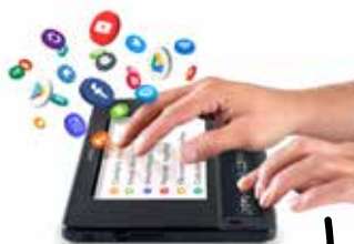
BrailleNote Touch

BrailleNote Touch Plus converts the user's typed Braille making IT work more accessible.