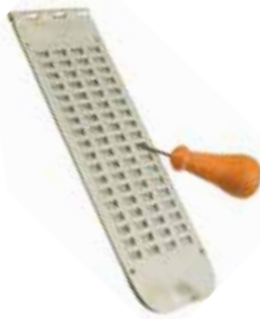
Braille Slate

A Braille Writer One of the earliest pieces of equipment used to write Braille - the raised dot system of communication created by Louis Braille in 1824.