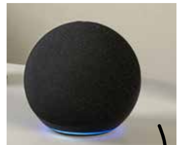
Amazon Alexa © Amazon.

Today the Amazon Alexa has revolutionised listening for the blind and vision impaired.