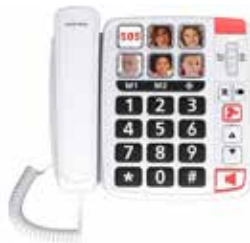
Swiss Voice Phone © RNIB Shop.

Large button and loud speaker phones can assist people with a hearing and sight impairment.