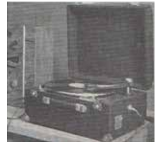
Gramophone © RNIB Heritage Services.

In the early years, a Gramophone played talking books with up to eight records per novel.